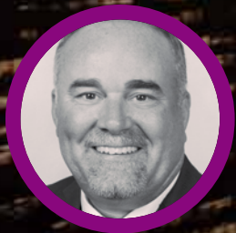
Hon. Todd Smith Ontario Minister of Energy